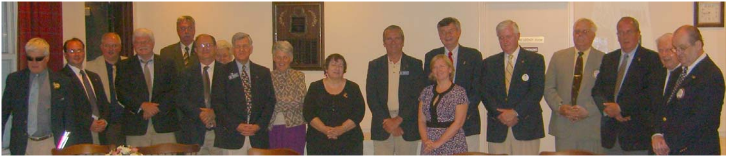
The installees, en masse.