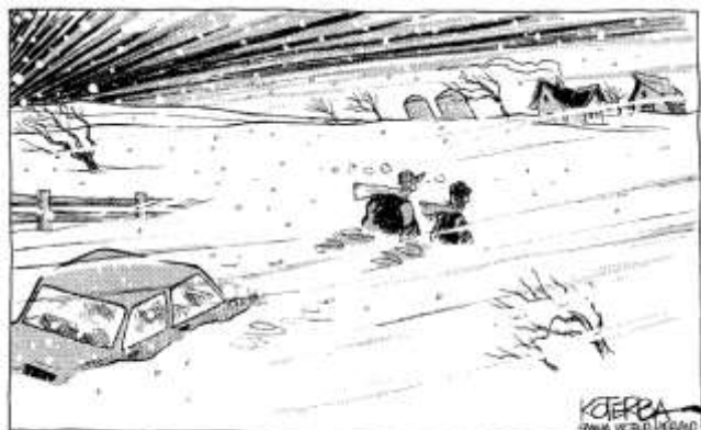
"REPEAT AFTER ME: AT LEAST WE DON'T GET HURRICANES... AT LEAST WE DON'T GET HURRICANES... AT LEAST..."