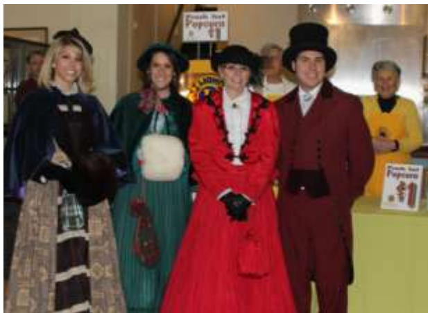
Lookin' good (but not buying any popcorn!)