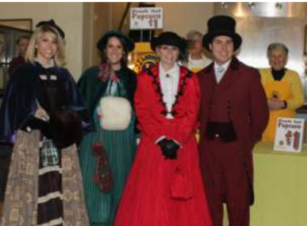
Lookin' good (but not buying any popcorn!)