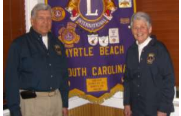
The Oxford shirts

There are two styles available: First is a BlueGen brand long-sleeve Oxford shirt in Navy. It's an easy-care 65% polyester/35% cotton poplin blend, washes nicely and needs no ironing. They have stain release and are wrinkle- and crease-resistant. Embossed on the left chest is "Albany & Troy Lions Club" and the Lions logo. Both Men's and Ladies' shirts are "Classic Fit." The Men's shirts have a button-down collar and a pocket. The Ladies' shirts have a spread collar (not button-down), straight bottom and no pocket. A size chart for the Oxfords is on the next page.