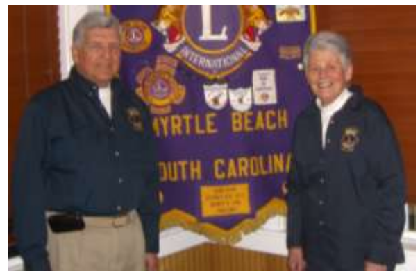
The Oxford shirts

Back in 2010, we ordered club shirts. They can be worn to club meetings, but they're really intended for any event where we're in public, such as a blood drive, serving meals at Joseph's House, cabinet meetings and other district functions, zone meetings, visitations to other clubs, state or international conventions, etc. If yours is worn out, or you didn't get one last time, or you're a new member, now's your big chance. I'd like to place an order very soon; we need to order at least 6, in any combination. We're supporting a local busi-