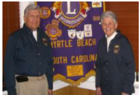
The Oxford shirts