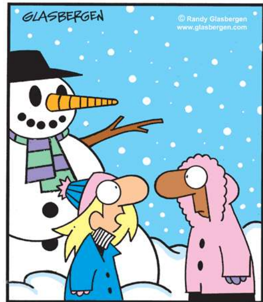
"If snow is made from water and water has no calories, how come snowmen are fat?"

Visit your club's web site: ALBANYTROYLIONS.ORG , your district web site: 20Y2LIONS.ORG , and International's web site: LIONSCLUBS.ORG .