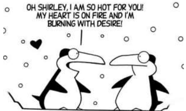
The Real Reason The Ice Caps Are Melting.