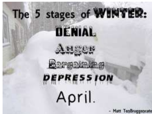
- Matt ToyBruggencate