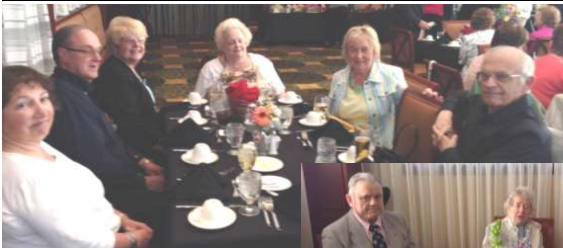
Lions and guests in various states of enjoyment.