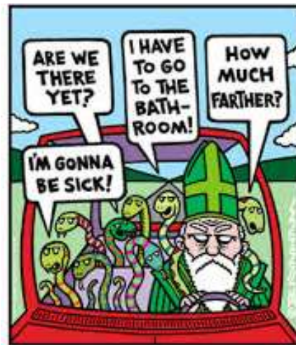
St. Patrick driving the snakes out of Ireland.