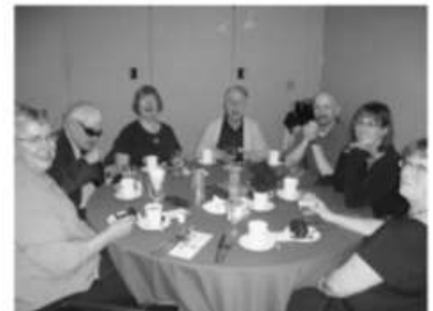
Diners enjoying dinner and friendship.