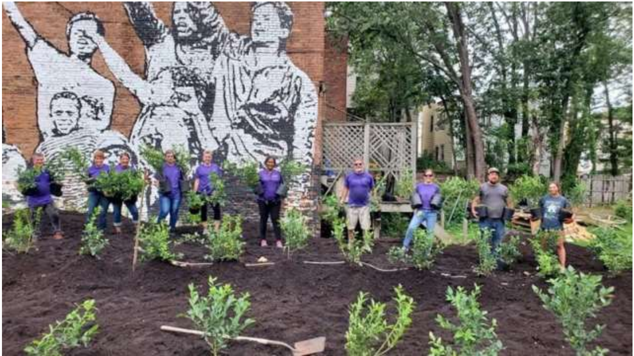
The Maximus team and the new blueberries