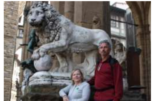
A gathering of Lions (and an interloper) in Florence, Italy