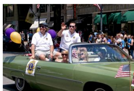
Incoming and outgoing DGs