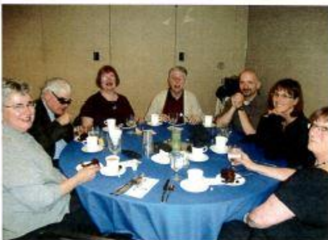
Diners from previous “Dinner in the Dark” had a great time!

The purpose of the “Dinner in the Dark” is a fun way to help raise awareness about living with vision loss. Blindfolded diners are joined by blind and visually impaired tablemates to share the experience. Dinner is followed by dessert and discussion with ACB members.