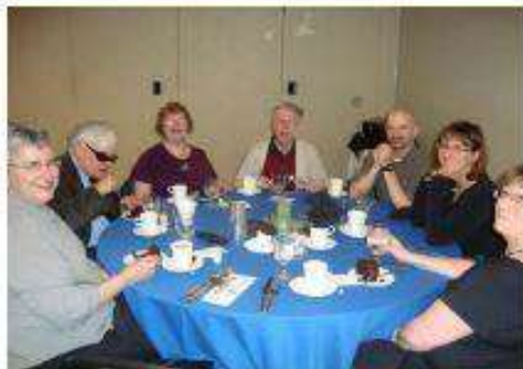
Diners from previous “Dinner in the Dark” had a great time!

Sponsorships available. Cash bar and silent auctions!