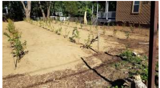
The West Hill Community Blueberry Orchard!

Why blueberries? Blueberries are an attractant for pollinators, which will increase agricultural yield in other nearby areas; they're full of nutrients and anti-oxidants and will be an excellent food source that is generally unavailable in the