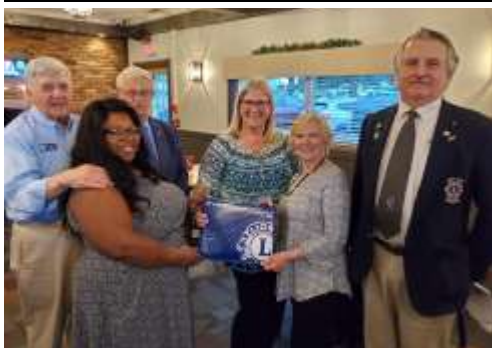
King Lion Eva joins the newly inducted Lions.