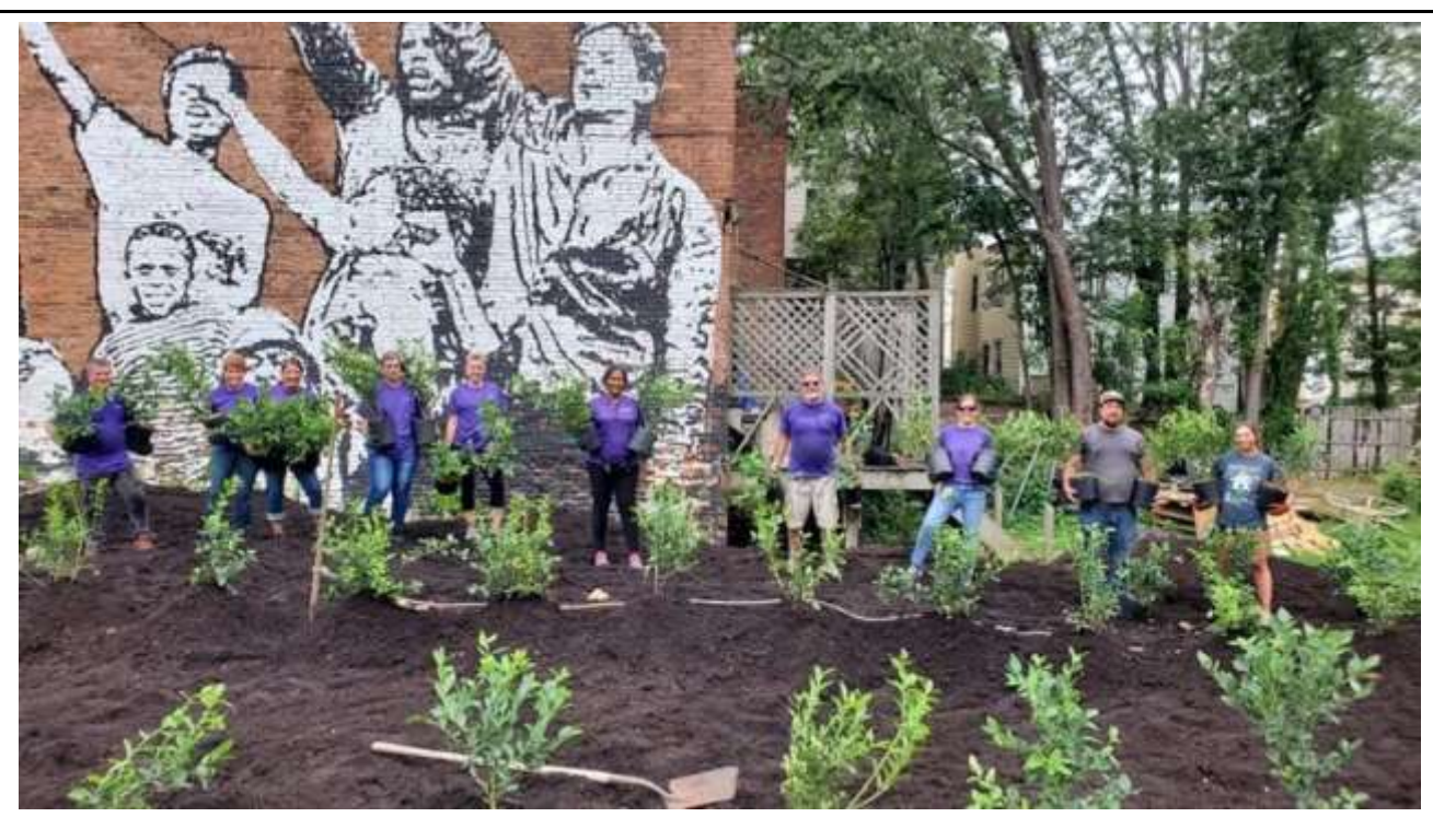
The Maximus team and the new blueberries