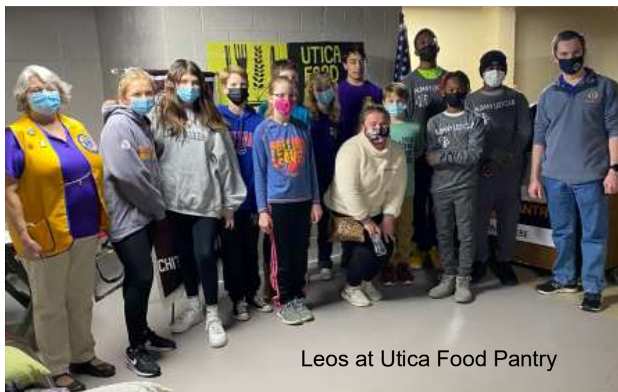
Leos at Utica Food Pantry